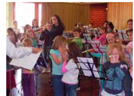
"Weep for me!"