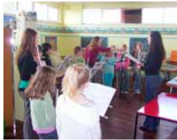
Rehearsing with Kirra! Can you see yourself??